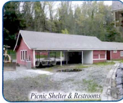
Picnic Shelter & Restrooms

meadow irrigation and pathways; and repair roadways, parking areas and utilities so they do not continue to deteriorate to a degree that they cannot be affordably restored. The cost to make the needed capital renovations and repairs is estimated at $6,137,493. If bonds are purchased and repaid over a 20 year