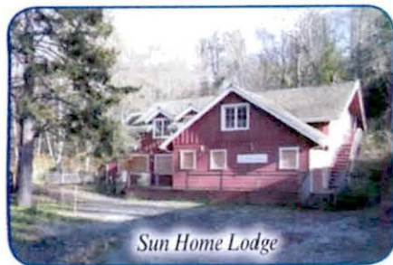
Sun Home Lodge

If the voters approve this proposition, the new funds will be used to restore and reopen the park's Dining Hall, Picnic Shelter, Restroom, Sun Home Lodge, Founders Lodge, cabins and cottages; replace the play area and wood bridge; install promontory and